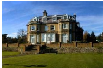
Bursledon Hall - Home of the DSRU, Southampton.

medicines in order to protect the public from untoward and unwanted side-effects of new medicines. The DSRU's activities are principally concerned with pharmacovigilance and pharmacoepidemiology, and the DSRU undertakes all forms of research studies and evaluations of the safety of medicines and provides education and training in pharmacovigilance and related subjects. The Unit's academic excellence is demonstrated through its production of publications in international peer reviewed journals since 1980.